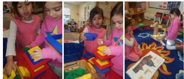
Young engineers, hard at work!